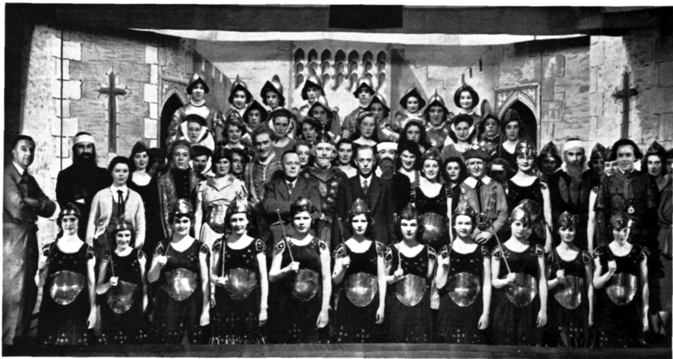
Princess Ida, 1953.