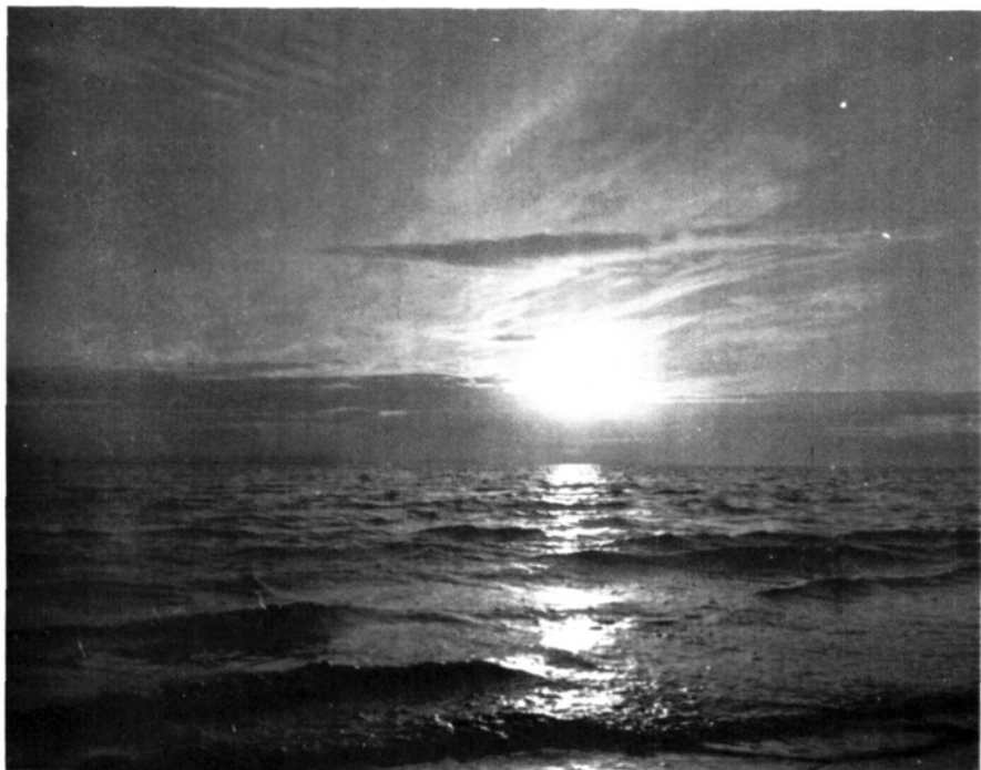
Sunset, by S. Darley.

This photograph was taken at 1.18 a.m. on January 19th, 1954, about 30 minutes after the commencement of the eclipse. It was done by placing a telescope magnifying twenty-eight times in front of an ordinary camera with the lens removed. The exposure was 2 seconds.