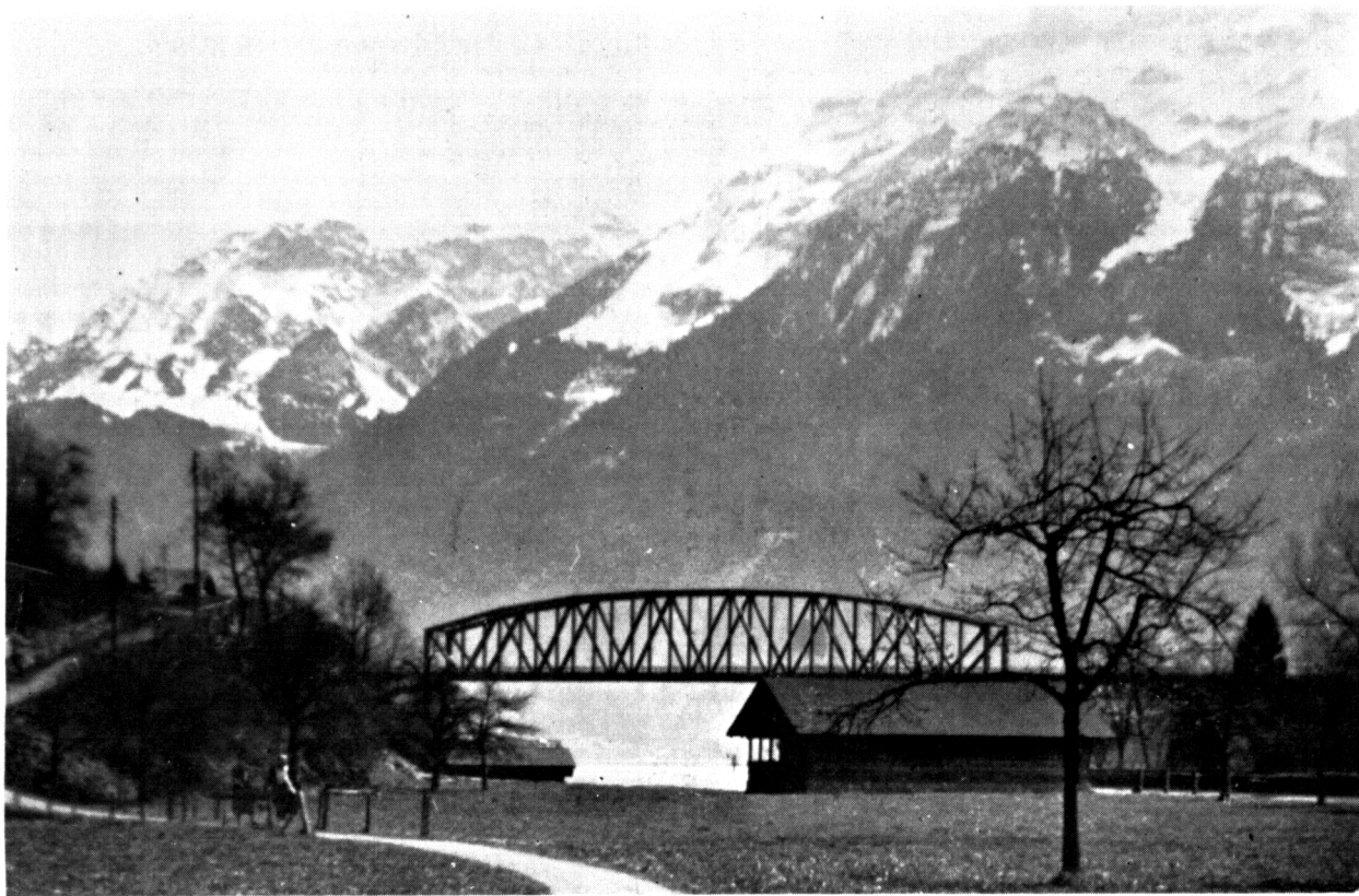
Interlaken, 1953, by E. Ware.